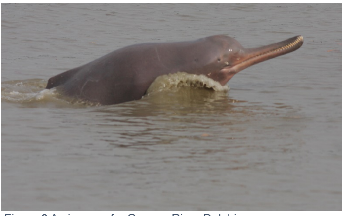
Figure 2 An image of a Ganges River Dolphin

1,800. The Ganges River is also home to Mahseer fish, gharials, turtles, otters and other species. The survival of the Ganges River dolphins has become difficult, this is due to unintentional killing with the use of fishermen leaving nets inside the river resulting in the dolphin becoming entangled and