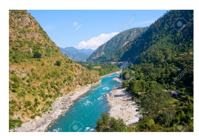
Figure 4 Ganges River in Himalayas Mountains

KA4, Generally effective communication of knowledge and understanding.