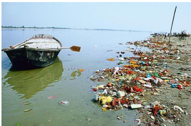
Figure 5 Ganges River in Bengal

The Ganges River provides a water source to more than 400 million civilians of the country, but the river is also a dumping place for industrial waste, sewage, and human and animal faeces, urine and even bodies which poses a great threat to the health of the people who live next to the river. Even though the civilians can see the pollution and the defilement, the traditional belief of the holiness of the