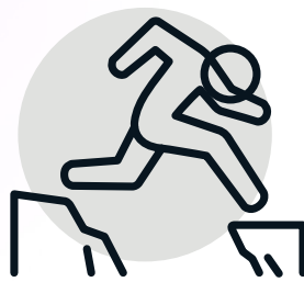
Deep understanding and skilful action