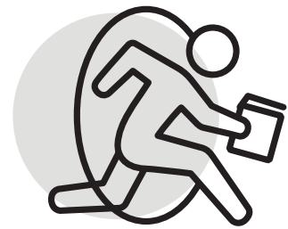
Ability to transfer learning