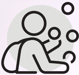
Lifelong learning zest for life